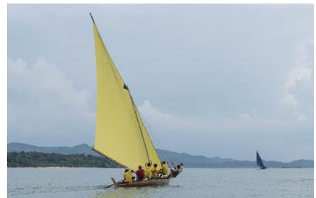
Charles LIM YI YONG, Stealing the trapeze 2016