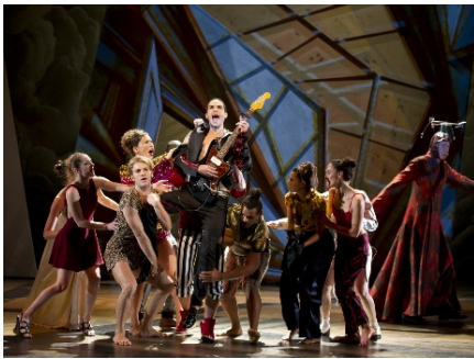
Compagnie DCA / Philippe DECOUFLÉ, CONTACT, 2014

For more information, please visit: http://aichitriennale.jp/english/artist/index.html#pa