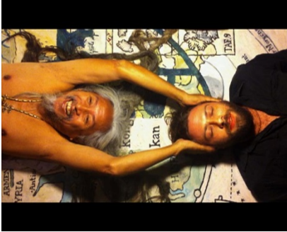
Kidlat TAHIMIK, Balikbayan #1 : Memories of Overdevelopment, 2015