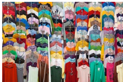
NISHIO Yoshinari + 403architecture [dajiba], PUBROBE 2013