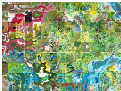
Jerry GRETZINGER, Jerry's Map , 2016 Courtesy of the artist