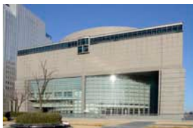
Aichi Arts Center