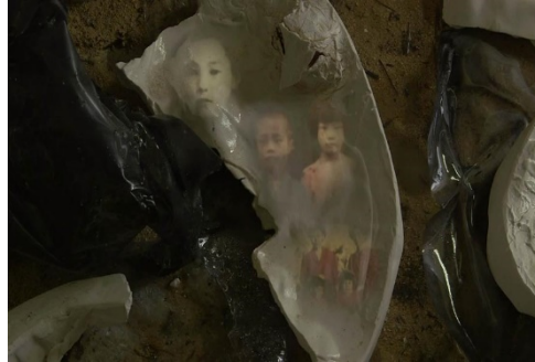
TAKAMINE Go, Queer Fish (post-production)