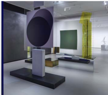
LIU Wei, Installation view at Bentu: Chinese Artists in a Time of Turbulence and Transformation, Fondation Louis Vuitton, Paris 2016

For more information, please visit: http://aichitriennale.jp/english/artist/