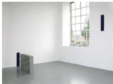
Giovanni ANSELMO, Verso Oltremare a nord in basso e a est sud est in alto , 1979