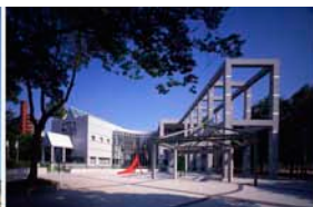
Nagoya City Art Museum