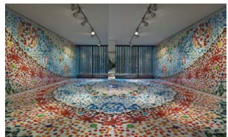
OHMAKI Shinji, Echoes-Infinity , MOMENT AND ETERNITY Third Floor-Hermès Singapore, 2012 Created with the support of the Fondation d'entreprise Hermès for Third-Floor Hermès Gallery - Singapore 2012.