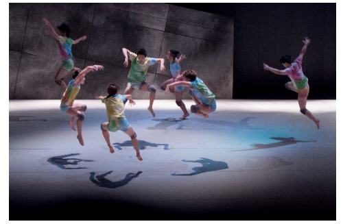
Co.Yamada Un, Monaka , 2015 © Naoshi Hatori