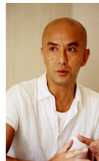
TESHIGAWARA Saburo © Norifumi Inagaki