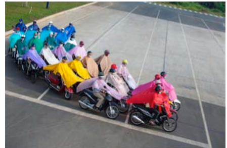
UuDam Tran NGUYEN, Waltz of the Machine Equestrians - The Machine Equestrians #12 , 2012